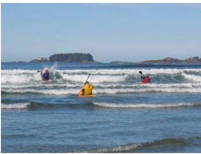
Cox Bay