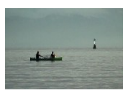
Willows Beach - January 2006