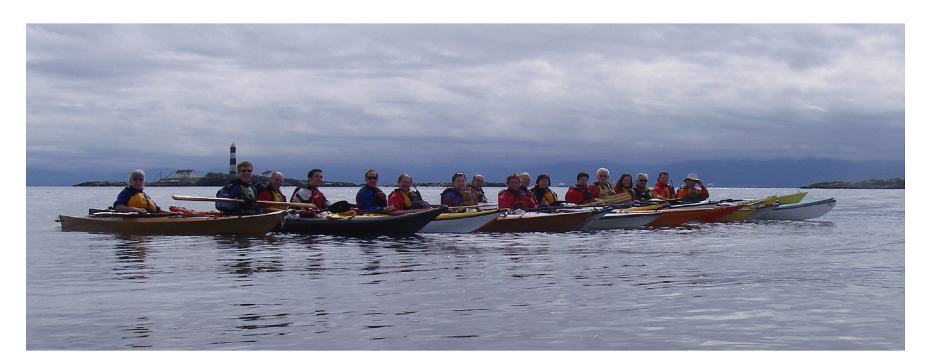
Race Rocks Paddle - March 2007