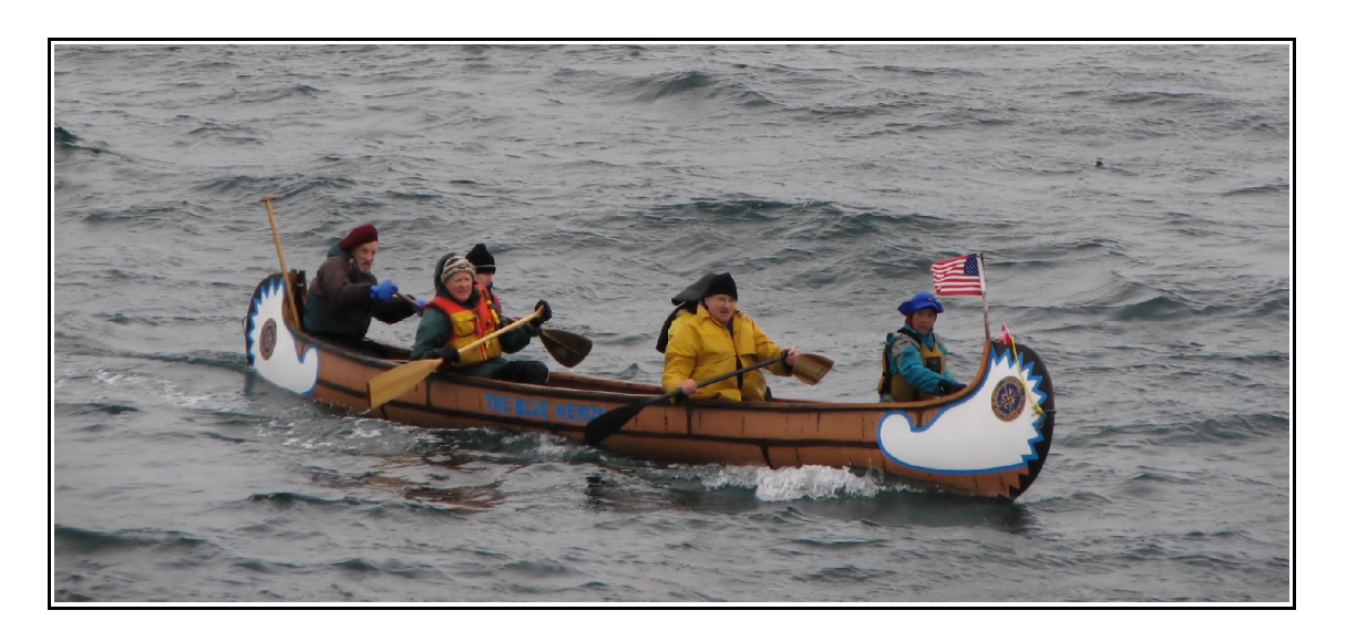
Voyageurs returning from Port Angeles, WA earlier this year