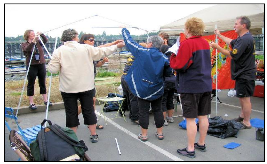
Dragon boaters erect tent ... At least, that's what they claim they're trying to do here.