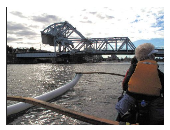
Friday Flyers approach the Johnston Street Bridge