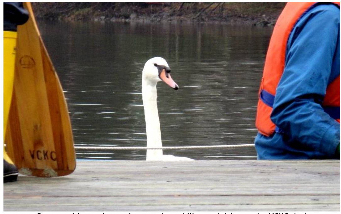
Gorge resident takes an interest in paddling activities at the VCKC dock