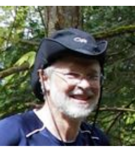
Clubhouse and Grounds Sandy Rattray