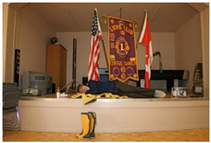
Catnap at Lions Clubhouse - Thanks BC Lions - Central Saanich