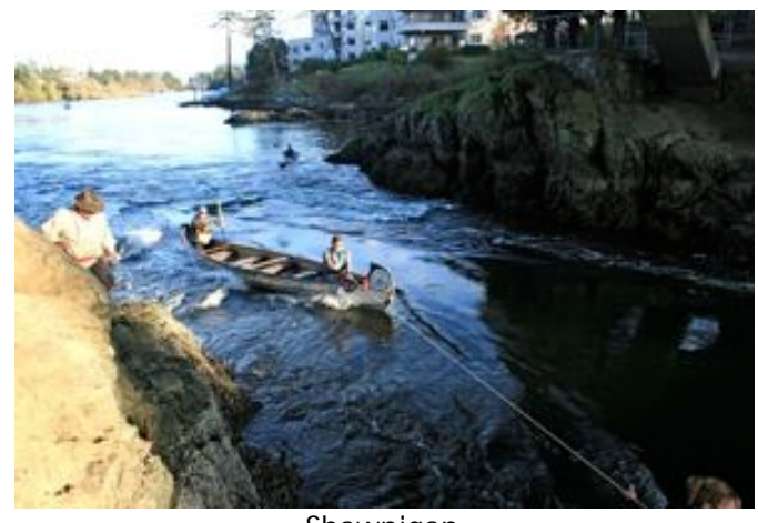
Shawnigan (which has subsequently under gone repairs)