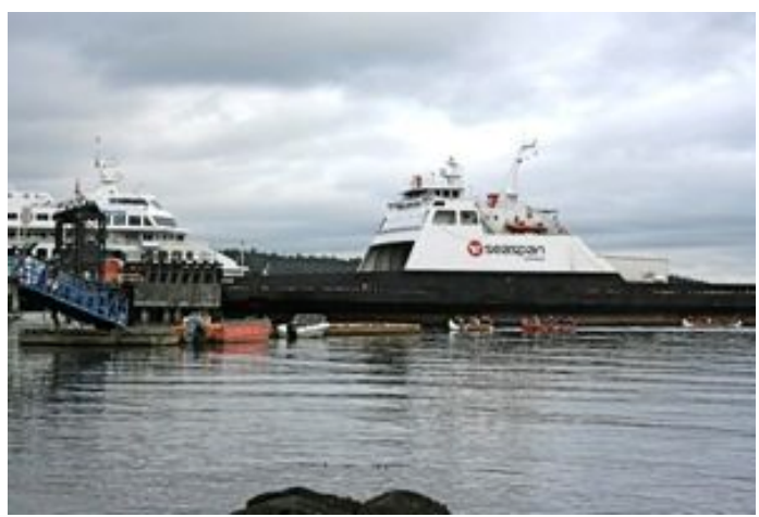
First Shift Change at Sidney Government Dock.