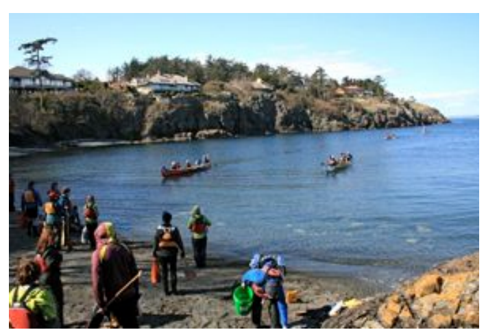
Shift two arrives after four and three quarters hours paddling.