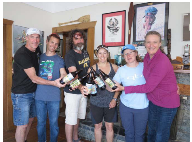
Switchblade 2 nd place winners