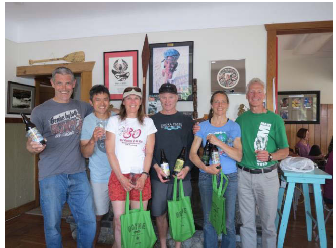
Switchblade 1 st place winners

Special Thanks to our sponsors: Hoyne Brewery; Fairway Markets; and Ocean River Sports.