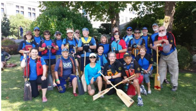
United Team at GorgeFest