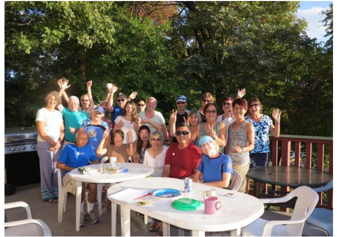
VCKC United Teamwindup barbeque

We encourage our dragon boaters to try other programs offered here at VCKC and hope to see you all again in early 2016 for the start of the next dragon boat season. A big thanks to all who participated this year.