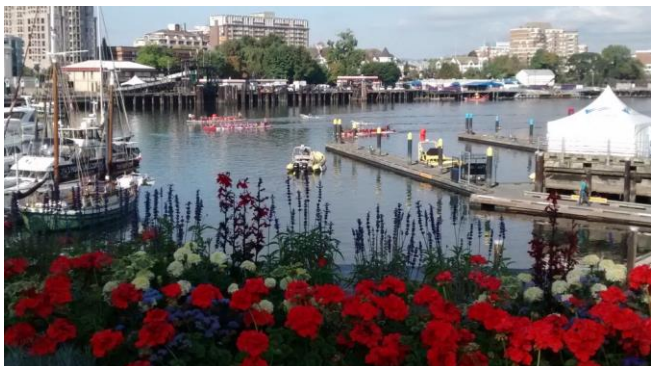
United Team at GorgeFest