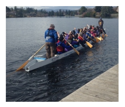
Learn to paddle session

Here are some dates to add to your calendar: <u>March 28<sup>th</sup> Wednesday</u>- team blood donation 4:05 followed by a potluck at the clubhouse at 6pm <u>April 4<sup>th</sup> Wednesday</u>: the start of regular practices- Monday and Wednesdays 5:45 warm up. Paddle 6-7:30