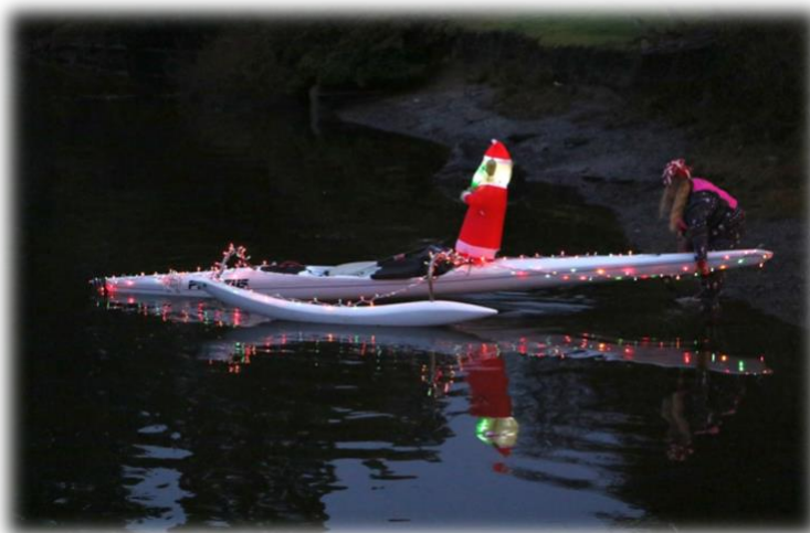
Best Small Boat