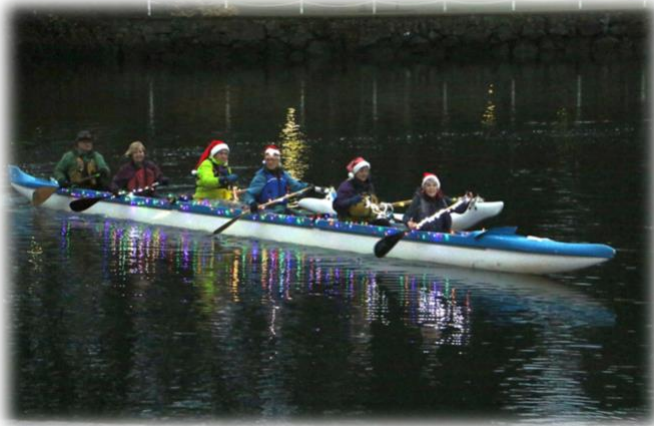
Best Big Boat

The VCKC Lighted Christmas Boat Paddle enjoyed a beautiful evening on the Gorge in early December. Although there were fewer entries than last year, there were some spectacular displays of lights! As the boats set off from the club we could hear spectators along the Gorge cheering them on. The judges had a hard time deciding on the winners and there was much debate as they watched the boats come and go. The “Most Christmas Cheer” went to the canoe that arrived back at the VCKC dock loudly singing Christmas carols! People walking along the path by the club enjoyed the hot chocolate and candy canes, as well as the festive atmosphere. Special thanks to Fairway Market for the donation of the hot chocolate, it’s always appreciated on a chilly evening!