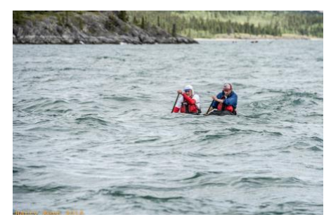
2019 Yukon River Quest

Marathon races vary in distances from ten kilometers to over 1000 kilometers for multi-day stage races. The longest marathon race in Canada takes place on the Yukon River, following along the same course as the Klondike Gold Rush miners. Competitors need to consume food and drink during throughout the race maintain their energy levels. Many competitors will drink through a hose and attach energy gels or bars to their equipment so they can be consumed on the fly.