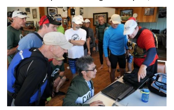
Getting the inside scoop on the route

Here are some pictures from "The Race That Was" in 2019. It was the first dedicated marathon race in many a year at VCKC with great weather and lots of challenges on the water. It's the one race that we had hoped to host again this year, but alas, it's not looking good.