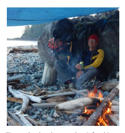
Time to hunker down and wait for things to improve.

A good May to all of you. It is a May, like none other. Thank you all for your patience to date with the reduced, well, nonexistent club activities. Just for old times' sake I went to our website and flipped through some pages. First thing that struck me was the professional/quality of the presentation. Those revolving photos on the first page depict a lot of people having a lot of fun. I can't wait until we add the SUP photo.