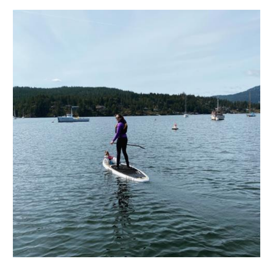
don't hesitate to get in touch!

We had originally planned to formally kick-off regular SUP paddles in April, but it looks like things are going to remain on hold for the foreseeable future. Fear not though, brand new Cascadia SUP boards were delivered in early March before things took a turn. These will remain packaged in storage until it is safe for us to paddle as a community. Although we are all excited to take these boards for a maiden voyage, as the old saying goes "you usually have to wait for that which is worth waiting for."