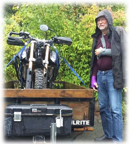
Broken right wrist, Broken left scapula, Talking about the bike is to painful.

The executive is putting together a process to have a virtual AGM. It could be a multi part process, so watch this space and possibly a couple of mass emails for instructions on how that will unfold. We are planning on a General Meeting before the end of the year as a practice but also just for the fun of it. Remember those General Meetings? Now Virtual. Cool.