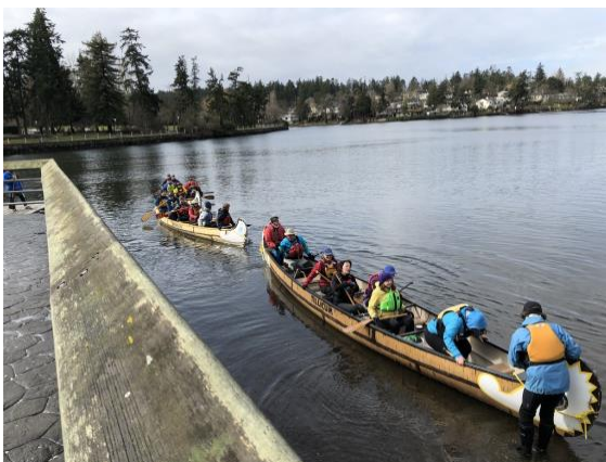
No longer just a memory