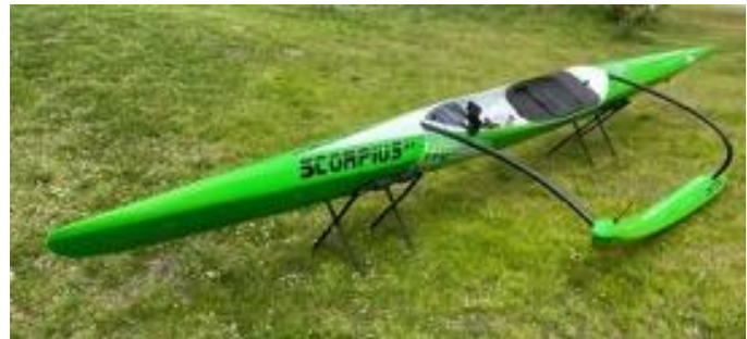
A Scopus XS OC1

The small boat program is poised to purchase two used Scopus XS OC1s. When they arrive from Vancouver, this will bring our total number of fiberglass OC1s to three. To accommodate new OC1 paddlers, we will also be on the lookout