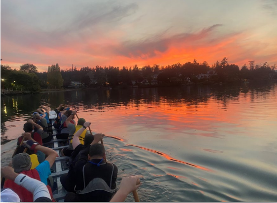
Fall 2022 Dragonboat practice at Sunset