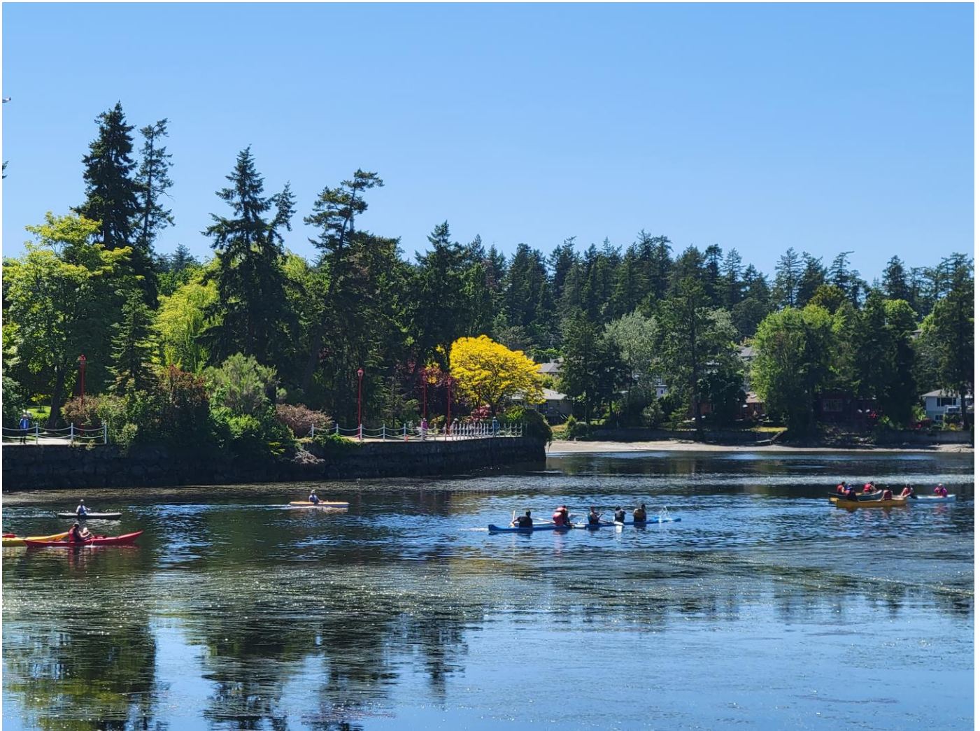
Many VCKC boats out on the water.