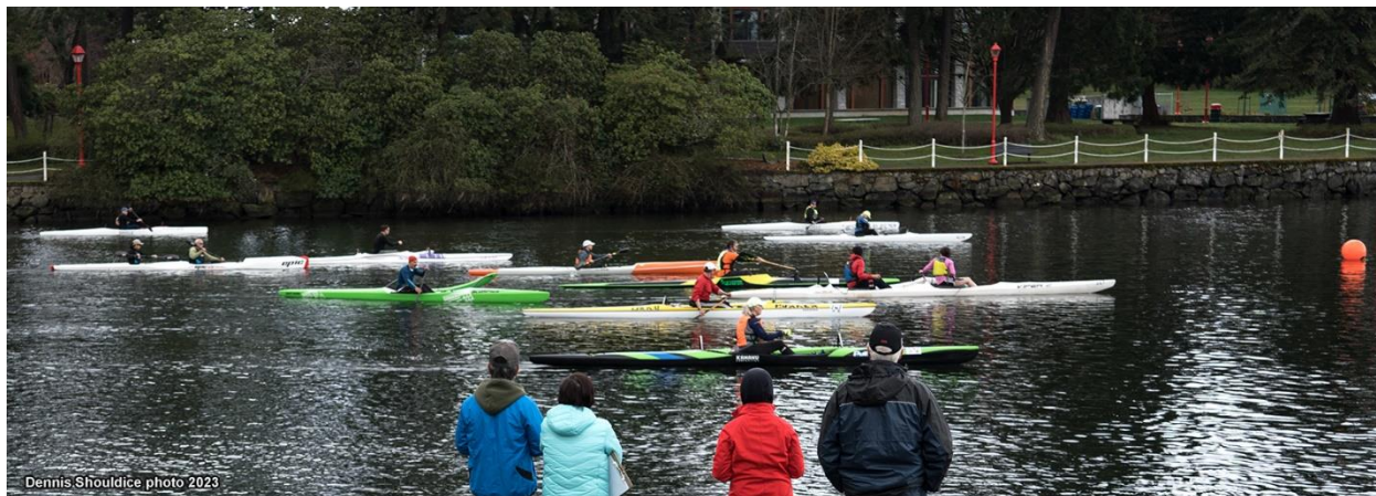
OCI's preparing to race at WUTG 2023

Inspired by the “screening out” process for the PFDs at the Safety Day, the marathon program recently took a hard look at a couple of tandem canoes that haven’t seen the light of day for almost a decade. So when we were contacted by a marathon paddler from Deep Cove inquiring about used boats for sale, we were able to accommodate them and provide them with a couple of boats at a very low cost. Afterall, the best place for any canoe or watercraft is being used on the water.