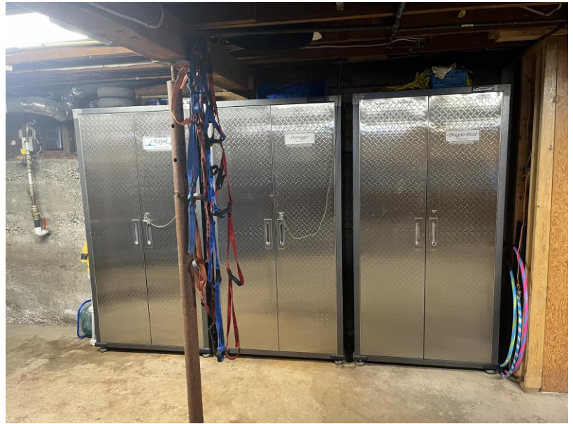
Above: Kayak locker on far left. Left: new Kayak locker with gear.

I personally put on club outings from the club for over a year in both kayak and big canoe every week plus instructional sessions. It is important that we have volunteers to lead or help lead as often people who volunteer burn out and we lose them. You need not commit to volunteering consistently to be helpful.