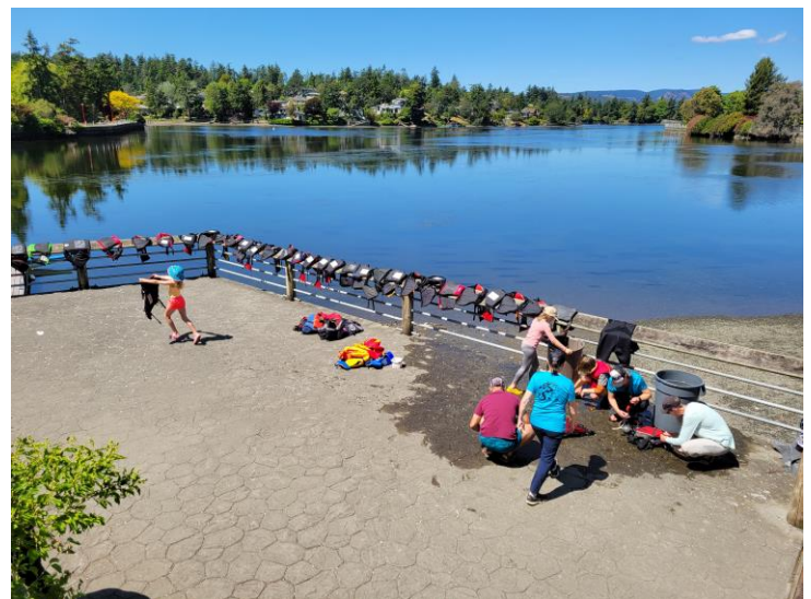
A family affair.