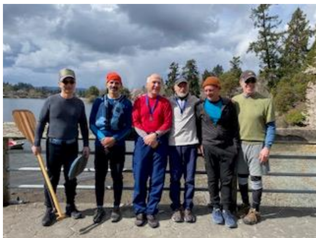
Men's Crew (WUTG – 2023)