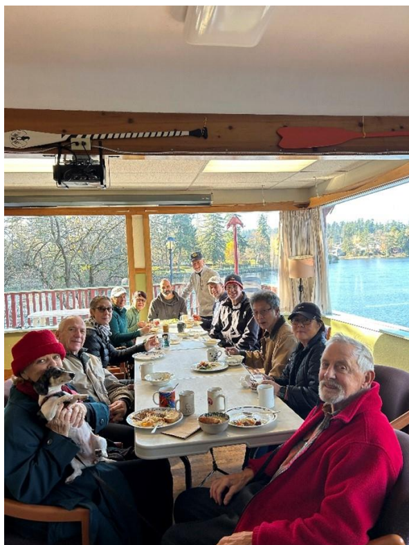
Marathon Year-end Potluck lunch