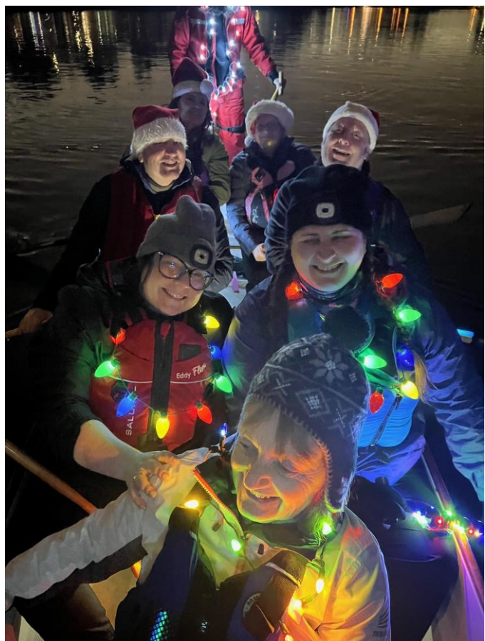
Winter Solstice Light Up Paddle Parade and Potluck

The Victoria Canoe and Kayak Club respectfully acknowledges that its activities take place on the traditional territories of the Lekwungen peoples, and that the land and waterways' historical relationship with the Songhees, Esquimalt and WSÁNEĆ peoples have existed since time immemorial. The Club is committed to taking meaningful action to build respectful and reciprocal relations with the Songhees, Esquimalt and WSÁNEĆ peoples on whose land and waterways club members have the privilege of living, working, and playing.