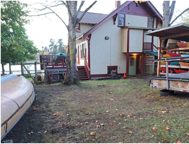
After the Fall Clean-up – So tidy!