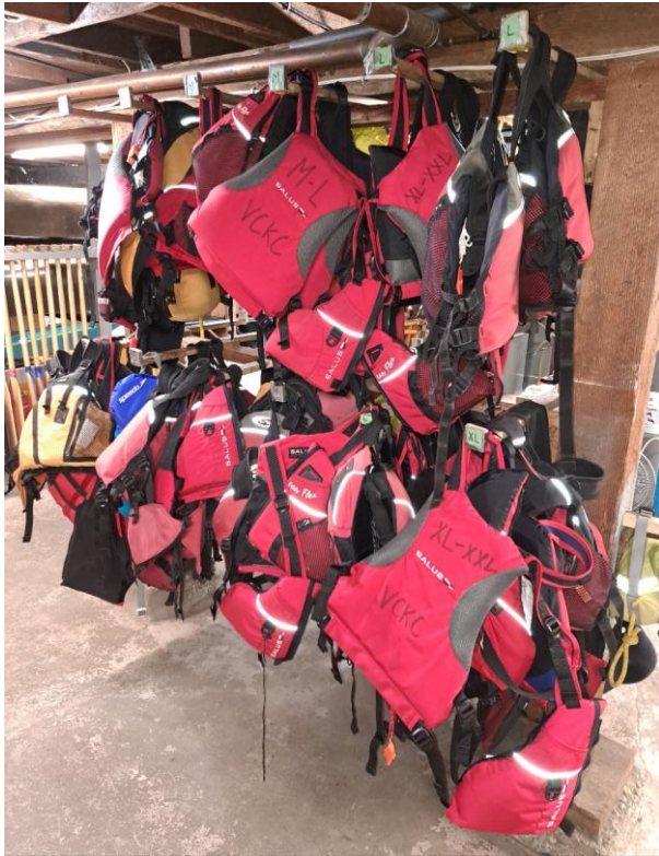
Improvements and expanded capacity planned