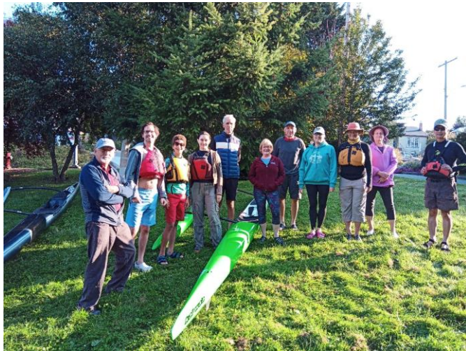
OC1 Orientation course #2 participants and instructors