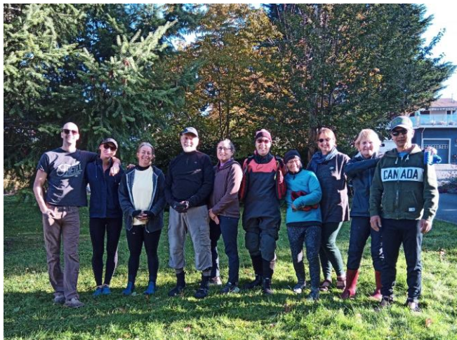
OC1 Orientation course #3 participants and instructors