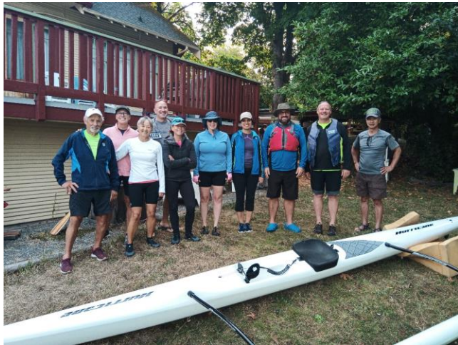
OC1 Orientation course #1 participants and instructors