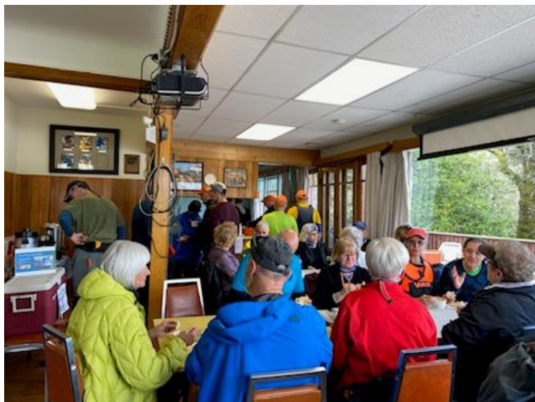
Wake up the Gorge Participants enjoy lunch

Highlights for the Marathon and Small Boats Program in 2023 included co-organizing “Wake Up the Gorge” in May together with the Outrigger Program and the launch of a highly successful OC1 orientation course. Participants in the marathon program take advantage of participating in races when the opportunity arises, and several local and mainland races saw participation by VCKC paddlers. 2023 also saw the purchase of three more OC1s. There are plans in 2023 to purchase two more used OC1s for club use.