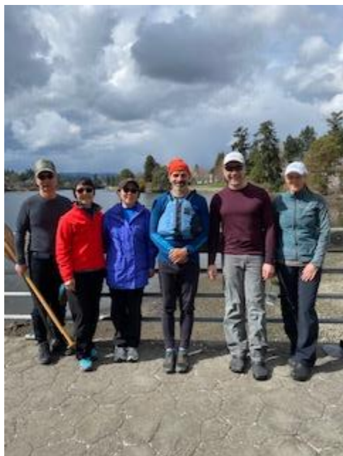
Mixed Crew (WUTG – 2023)

The marathon program is a year-round program that attracts a dedicated group of experienced and skilled paddlers. At the same time, there is an on-going capacity to welcome new members, particularly those who wish to cross-train with other activities such as outrigger paddling. The program also periodically welcomes visiting paddlers from other clubs and provinces. The marathon program officially operates four times a week (Tuesday, Thursday, Saturday, Sunday @ 8am). The marathon program entered two OC6 teams in WUTG and several participated in the small boat race.