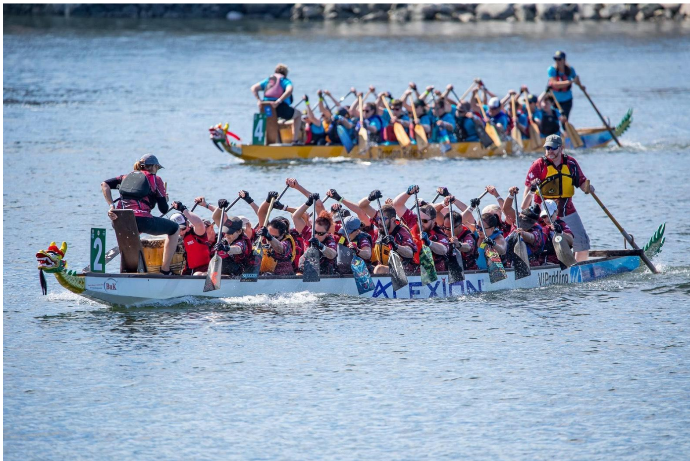
VCKC Dragonflyers competing at the Victoria dragon boat festival.