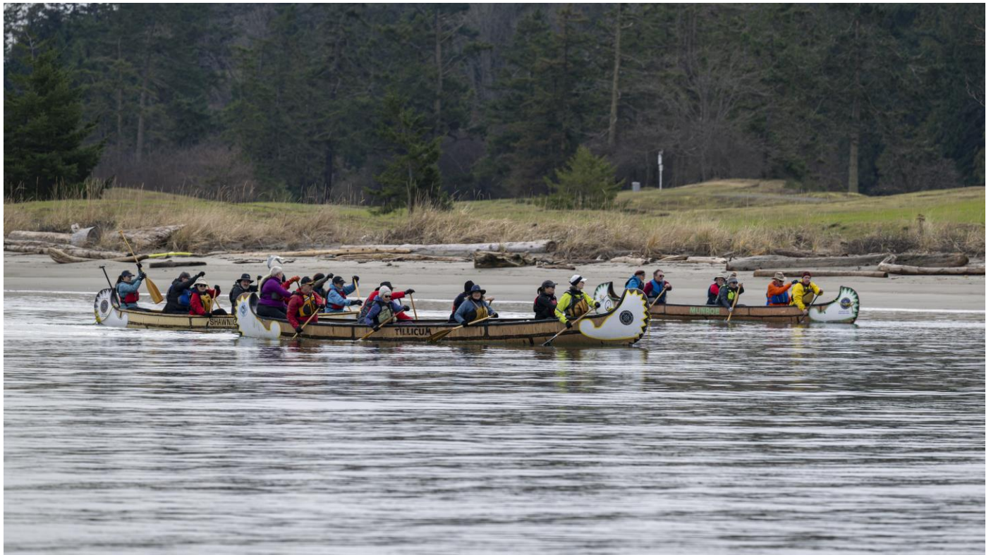
Big Canoes out for a paddle early February 2024